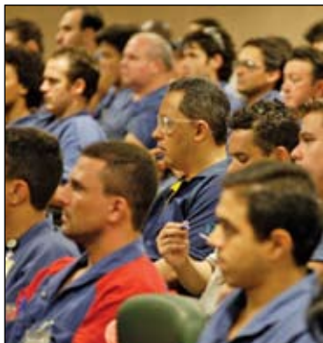
Complete R.O.T. Training & Certification (In-house or on-site)

Propane is available for sale in 100lb cylinders for construction, or you can purchase bulk supplies of propane to meet your jobsite requirements at many of our Battlefield locations. Please ask your Sales Representative for a list of Battlefield Equipment locations that provide a bulk fueling station.